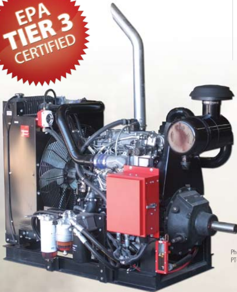
Photo Includes the following optional equipment: PTO and L150 Sight Water Level Gauge