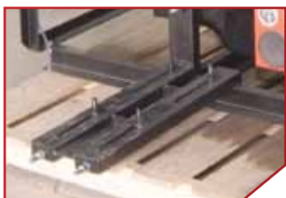
▶ Side Generator Mount