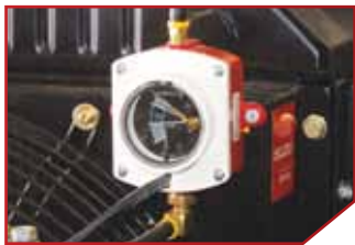
▶ L150 Sight Water Level Gauge