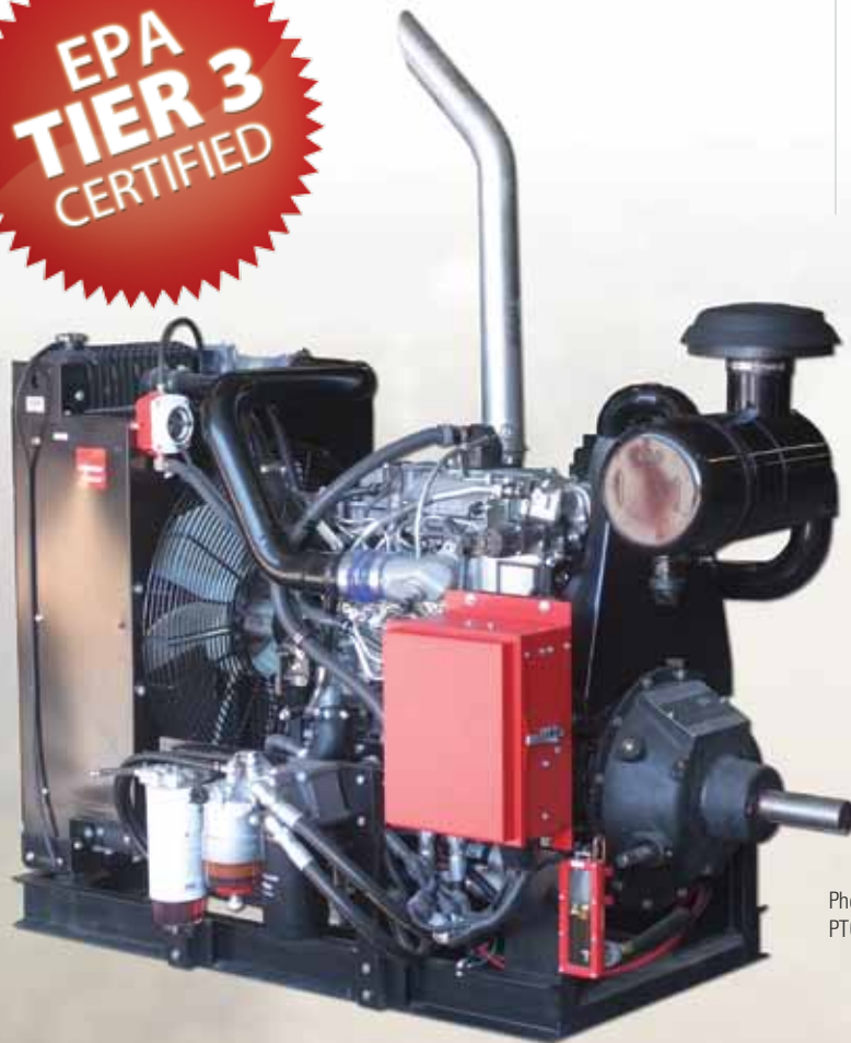
Photo Includes the following optional equipment: PTO and L150 Sight Water Level Gauge